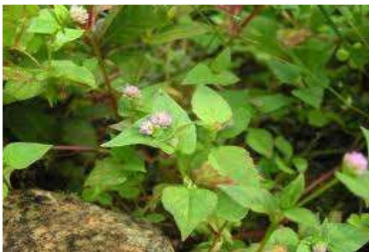
Fig. 5. Polygonum nepalense . Flowering plants.

The fact that these plants are found to have same uses in different places, giving the same results, is testimony to their effectiveness in the treatment of hemiplegia/neuralgia symptoms.