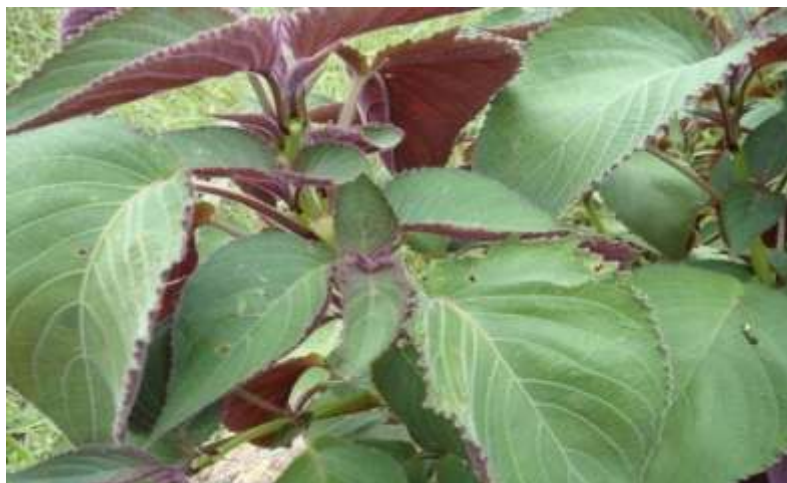
Fig. 3. Eremomastax speciosa . Leafy plant. Superior side of the limb green, lower side crimson.

In Table 3 (column 2), there are therapeutic preparations that may have successfully treated hemiplegia/neuralgia patients. The net result is the drop in frequency of crisis registered for 11 patients out of 16 (40.7%). They used 19 recipes as in Table 4 column 3, with an average of 2.36 recipes per patient. The most used recipes are R9 (8 patients); R3, R4 and R13 (7 patients respectively); R1, R7 and R13 (5 patients respectively). The most used plants are Eremomastax speciosa (Fig. 3) in 5 preparations, Crinum jagus (Fig. 4), in 4 preparations.