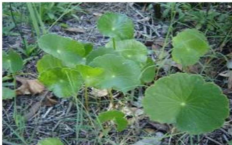
Fig. 6. Hydrocotyle bonariensis with circular and peltate leaves (i.e. stalk attached to the middle of the leaf).

Laboratory analysis showed some of the plants having substances with anti-hemiplegic and anti-neuralgic effects. For example, Centella asiatica contains asiaticoside consisting of 3 sugars (2 glucose + 1 rhamnose teichoic acid). This last acts on the connective tissue in the biosynthesis of collagen. It has healing and eutrophic properties of the connective tissue. [19] These properties of the Centella asiatica extracts serve as good remedies in the treatment of ulcers as well as the treatment of hemiplegia/neuralgia. The use of this plant species in Bui Division possibly indicates authenticity of its usefulness in other diseases: healing of leg ulcers, [20] gastric ulcers recovery, [21] regression of the lesions produced by schistosomiasis. [22] We got satisfactory results with the extracts of Centella asiatica in the treatment of the varicose veins, varicocele due to orchidoptosis, clearing of the thoracic aorta and glaucoma due to trabecula subsidence. [23]