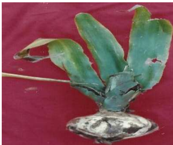
Fig. 4. Crinum jagus . Bulb and leaves.