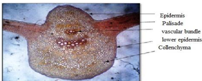
FIG. 2 T. S. of leaf (with Phloroglucinol HCL staining )

[i] Epidermis [ii] vascular bundle [iii] collenchymas [iv] palisade cells [v] stomata [vi] calcium oxalate crystals. [see fig.2 and 3.