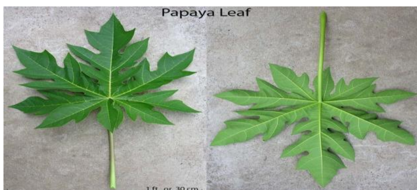
Figure 1.2: Dorsal View.

Papaya leaves were examined to study morphological and organoleptic characters. Sample for microscopy were prepared by embedding in solvent system consists of formalin, glycerine, water (8:1:1) for a week. The sections were taken and then they were seen under microscope (Motic of B1 series) at 10x, 40x, 100x after staining with Phloroglucinol & HCL. The papaya is a large, tree-like plant, with a single stem growing from 5 to 10 m (16 to 33 ft) tall, with spirally arranged leaves confined to the top of the trunk. The lower trunk is conspicuously scarred where leaves and fruit were borne. The leaves are large, 50–70 cm (20–28 in) in diameter, deeply palmately lobed, with seven lobes. Unusually for such large plants, the trees are dioecious. The tree is usually unbranched, unless lopped. Organoleptic property of leaf powder is green to dark green in colour, with smooth surface. The drug powder is irritating with characteristic odour and bitter in taste.