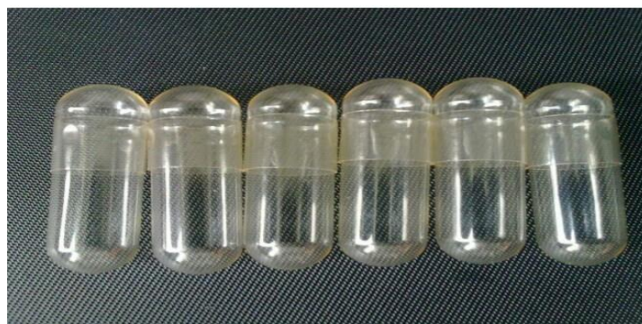
EMPTY VEGETABLE CAPSULE SHELL

Polysaccharides exhibit great diversity of structural features in terms of the monosaccharide composition, linkage types and patterns, chain shapes, and degree of polymerization, thus influencing their physical properties. [10]