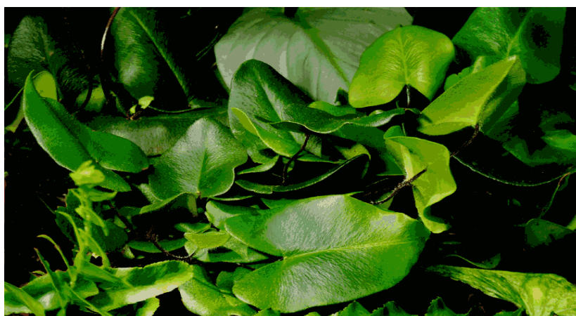
Figure. 1. Hemionitis arifolia (Burm.) Moore.

Pteridophytes are not infected by microbial pathogens, which may be one of the significant aspects for the evolutionary achievement of pteridophytes and the information that they stay alive for more than 350 million years. In view of the rich diversity of Indian medicinal plants as well as Pteridophytes, it is predictable that, the screening of plant extract for antibacterial activity might be helpful for humans and plants diseases (Sharma and Vyas, 1985). In recent years antibiotic resistance has become a global concern. This drives the need to screen medicinal plants for novel bioactive compounds as they are biodegradable, safe and have fewer side effects (Prusti et al. , 2008).