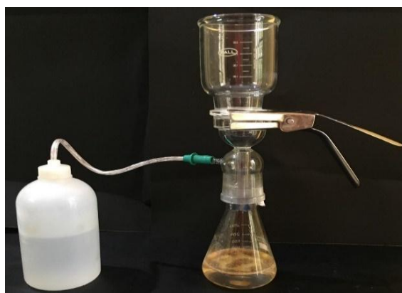
Fig. 1: Reaction Set up- Sample Chukku NEI.

Each value represents the mean ± SD. N=3