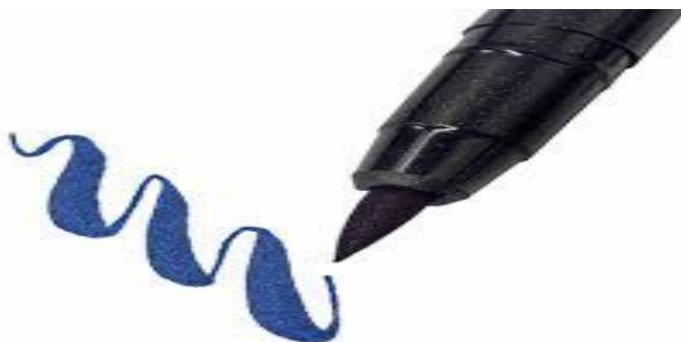
Preparation of marker formulation.

Fluconazole (1% w/w) was dissolved in hot mixture containing propylene glycol (20% w/w) and glycerine (10%) as moistening agent. [10] Carbopol 934 polymer and purified water taken in beaker and allowed to soak for 24 hour and than the previous mixture add in this than the pH of carbopol gel was adjusted using TEA and continuous stirring add little minute quantity of Kmno_4 menthol for cooling effect and and methyl paraben and propyle paraben than this gel preparation put in a marker form container. [11,12,13]