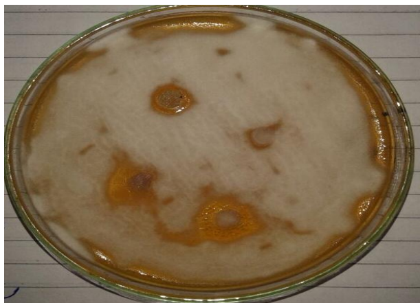
Figure 3: Effect of alcoholic extract of Tridax procumbens linn on Aspergillus Flavus