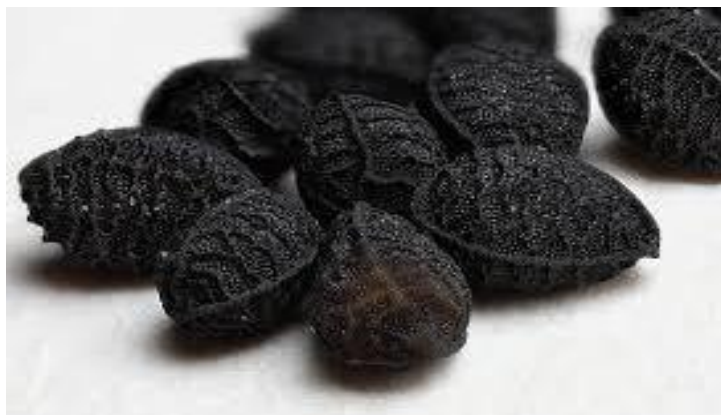
Fig: Nigella Seed