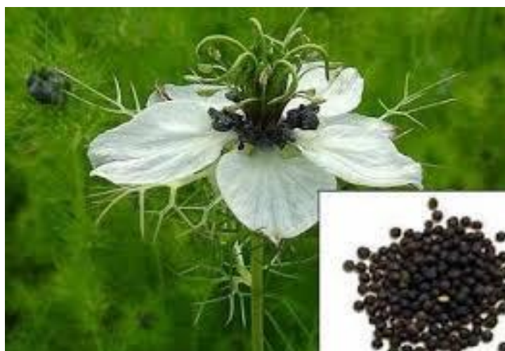
Fig: Nigella Flower.

Macroscopically, seeds are small dicotyledonous, trigonus, angular, rugulose-tubercular, 2-3.5mm1-2 mm, black externally and white inside, odour slightly aromatic and taste bitter. Microscopically, transverse section of seed shows single layered epidermis consisting of elliptical, thick walled cells, covered externally by a papillosecuticle and filled with dark brown contents. Epidermis is followed by 2-4 layers of thick walled tangentially elongated parenchymatous cells, followed by a reddish brown pigmented layer composed of thick walled, rectangular elongated cells. Inner to the pigment layer, is present a layer composed of thick walled rectangular elongated or nearly columnar, elongated cells. Endosperm consists of thin walled, rectangular or polygonal cells mostly filled with oil globules. The powder microscopy of seed powder shows brownish black, parenchymatous cells and oil globules.