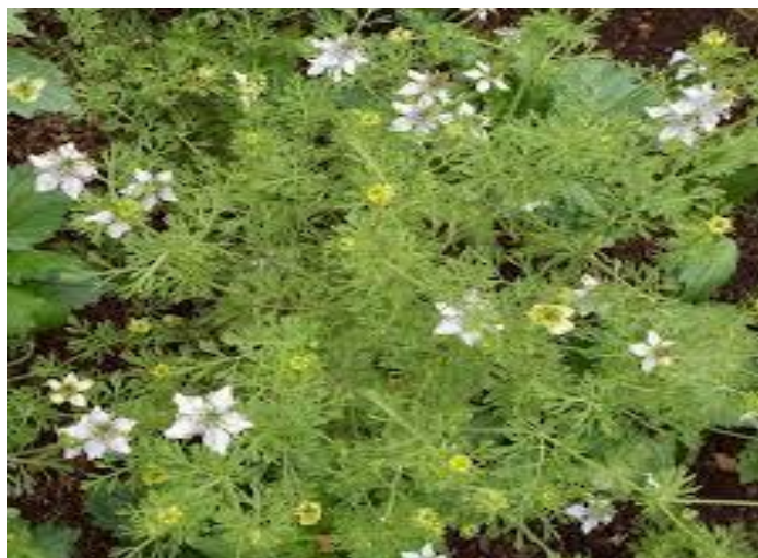
Fig: Nigella sativa plant