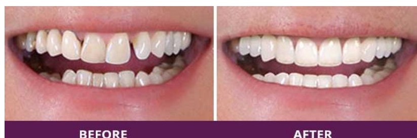
Figure No 15: Before and After treatment with Tooth Contouring and Reshaping.

Sometimes little defects in teeth can attract more than their fair share of attention. The eye often seems drawn to the tiny chip in a front tooth; the slight divergence in tooth size among adjacent teeth; the extra-pointy canine. If you find yourself staring at these understated yet distracting features in your own smile, it's treated often with a minimally invasive, relatively cheap procedure known as tooth contouring (re-shaping).