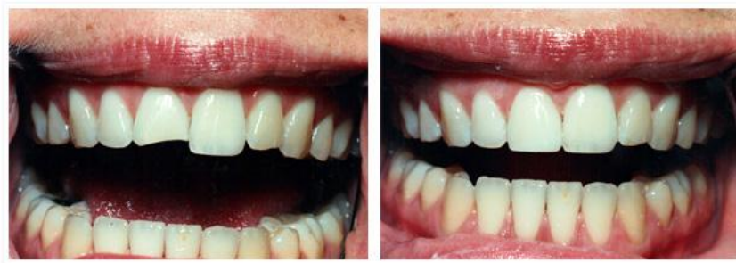
Figure No: 2 Teeth before and after the treatment with composite bonding.

Composite bonding is a cosmetic procedure in which a type of dental material – in this type, composite resin – is shaped and molded on your teeth to offer the look of straight, white smile. It can be cast-off as a cosmetic solution to cracked teeth, gapped teeth and discoloration in both teeth and fillings. Composite resin bonding is not for every person. If your smile is crooked as the consequence of an over-bite or under-bite, this treatment would not aid to correct it.