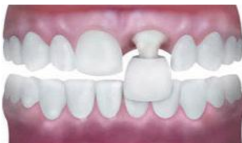
Figure No: 5 Porcelain Crowns.

Porcelain is a kind of ceramic made by firing and piling and ceramic speak of porcelain only. Pure-porcelain is the solitary crown which gives the desired transparent appearance to the tooth. The main drawback in expending all porcelain-crowns for retaining the front tooth is that the knowledge essential to place them is very thought-provoking but still are located there for their aesthetic demand. They are transparent in color and commonly, their shade is prejudiced by the tooth underneath them.