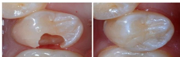
Figure No: 13 Teeth before and after treatment with Tooth Colored Filling.

Tooth colored fillings, also called white fillings, are dental fillings that repair and mimic the natural look of tooth structure. In addition to restoring teeth that have cracked or decayed, tooth colored fillings may also be used cosmetically to alter the size, color and shape of teeth. This quality is mainly useful in finishing gaps between teeth; repairing chipped teeth and make teeth seem to be more straight or even.