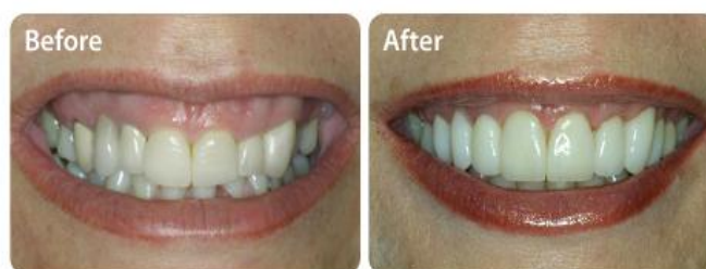
Figure No: 14 Before and after treatment with Cosmetic Gum Surgery.

Cosmetic gum surgery, also known as aesthetic crown enlargement, can be a transformative skill for people who think that their gums rest too low or too high on their teeth. Cosmetic gum surgery, or periodontal surgery, can correct almost any malformation or gingival problem. Most people have their gums redesigned to improve the look of their smile. However, some people undergo gum-contouring operation as part of other essential periodontal procedures, such as crown enlargement, pocket lessening, and reformative procedures.