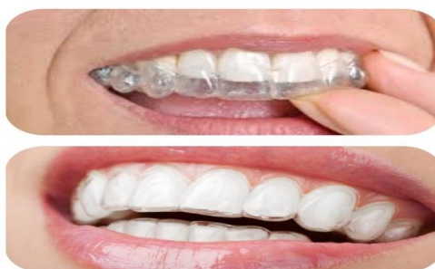
Figure No: 13 Clear Orthodontic Aligners.

Clear orthodontic aligners can straighten a dental patient's teeth deprived of the wires and brackets of outdated braces. The aligners contain of a sequence of clear, changeable trays that fit over the teeth to straighten out them. Each tray must be damaged by the patient for a stated quantity of time typically around 20 hours a day for two weeks—before the patient can advancement to the next tray. In most circumstances, the aligners can straighten teeth in anywhere from six to 18 months.