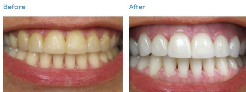
Figure No: 1 Teeth before and after Teeth Whitening.