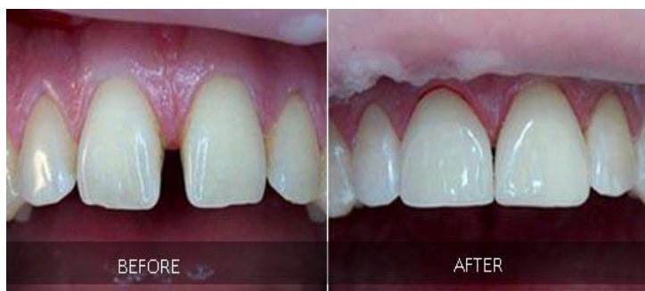
Figure No: 4 Teeth before and after treatment with Veneers.