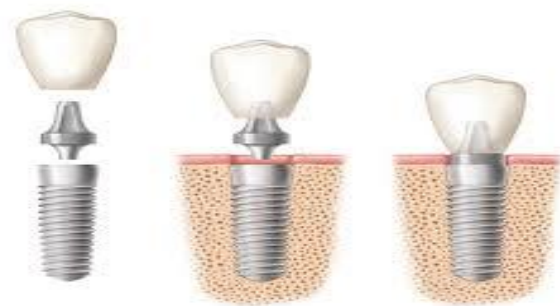
Figure No: 9 Dentals Implants.

Dental implants are metal supports or frames that are surgically placed into the jaw-bone underneath your gums. Once in place, they let the dentist to mount replacement teeth onto them. Bridges mounted to implants would not slip or shift in the mouth — an exclusively important benefit when chewing and talking. This safe fit helps the dentures and bridges as well as distinct crowns placed over implants feel more natural than conventional bridges or dentures. An advantage of implants is that no neighboring teeth need to be arranged or ground down to hold your new replacement tooth/teeth in place.