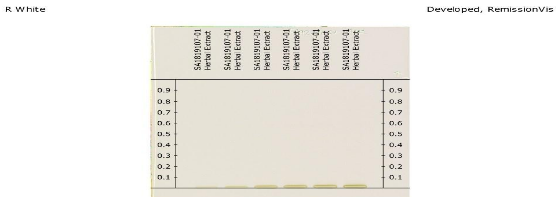
Fig. 2: Alkaloids confirmation at visible derivatisation with Dragendorff reagent.

It was observed that track 1-5 shows methanol extract. The Fig. 3 shows separation of constituents.