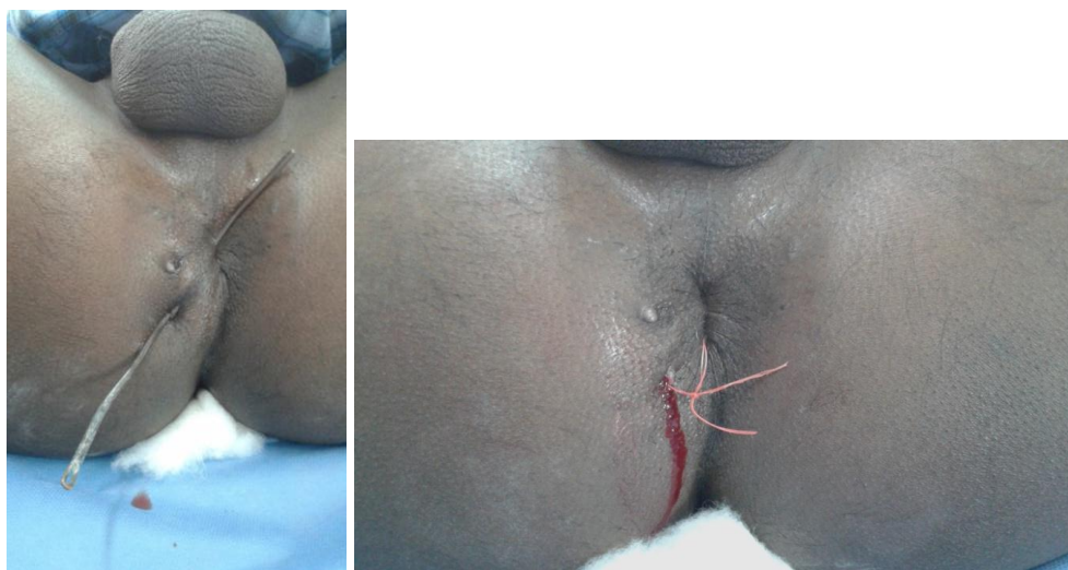
Probing kshara sutra ligation